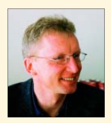
"[The students] are first class."